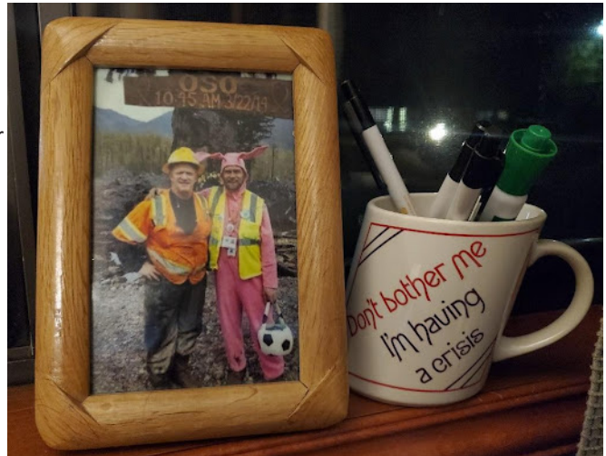
A photograph of the author in his Easter Bunny costume visiting responders. The photo hangs above his desk as a constant reminder to step away and fill your reserves.

Then the day took an unexpected turn. The Operations lead showed us that, while the morning briefing was happening, staff from the secondary EOC on the far side of the response zone had sent a requisition form that included a request for candy and an Easter Bunny. They had no knowledge of what we had planned at the